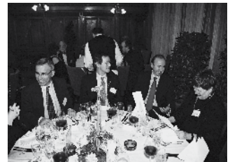
Impression from the event in 2001, reflecting 10 Years of experience with the „Vienna Agreement“.